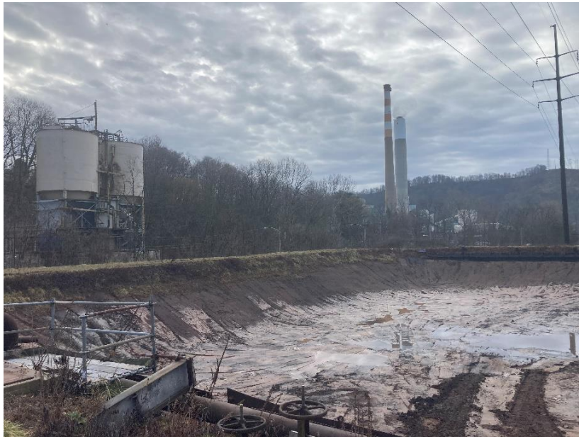
Photograph 1: Emergency Ash Pond, facing Southeast. Date: 3/24/2021

Description: Southern and Eastern embankments of Emergency Ash Pond after CCR removal. The sideslopes and pond bottom were visually inspected and no CCR was observed.