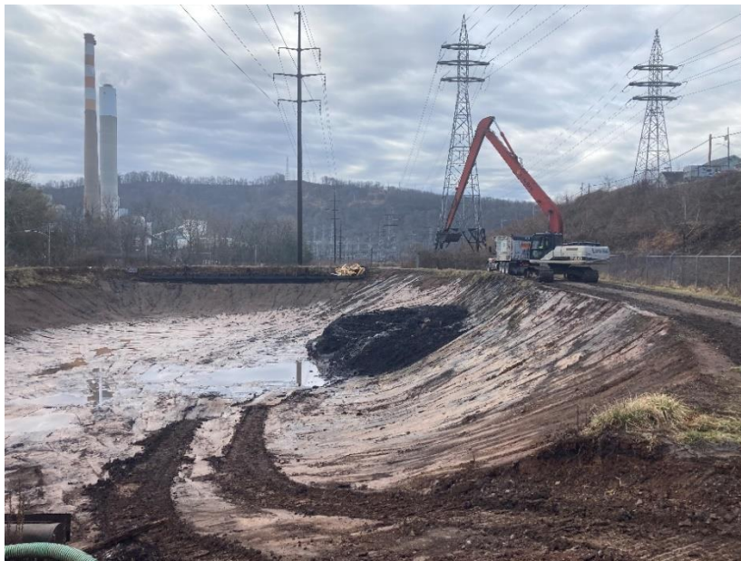
Photograph 2: Emergency Ash Pond, facing South. Date: 3/24/2021

Description: Southern and Eastern embankments of Emergency Ash Pond after CCR removal. The sideslopes and pond bottom were visually inspected and no CCR was observed.