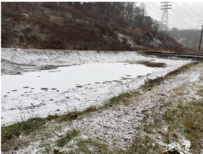
Photograph 3: Bottom Ash Recycle Pond, facing Northwest. Date: 12/16/2020 Description: Bottom Ash Recycle Pond following CCR removal.