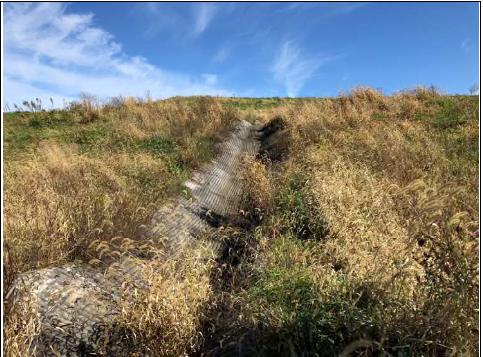
Image: 2547 Date: 10/23/2018 Time: 1:30 PM Direction: Northwest Description: Stormwater energy dissipator at toe of slope is functioning as intended.

Image: 2545 Date: 10/23/2018 Time: 1:29 PM Direction: East Description: Non-contact stormwater downchute. Clear of obstructions. Revetment is in good condition. Functioning as intended.