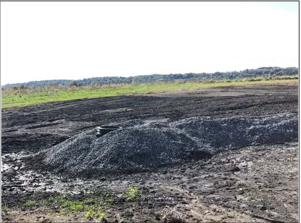
Image: 2513 Date: 10/23/2018 Time: 1:15 PM Direction: South Description: Stage 4 intermediate cover. Vegetation had only partially seeded during the 2017 inspection, but now has full coverage.

Image: 2511 Date: 10/23/2018 Time: 1:15 PM Direction: Southwest Description: Vertical leachate riser within active area. The ground is sloped to drain into this riser, with contact water treated as leachate.