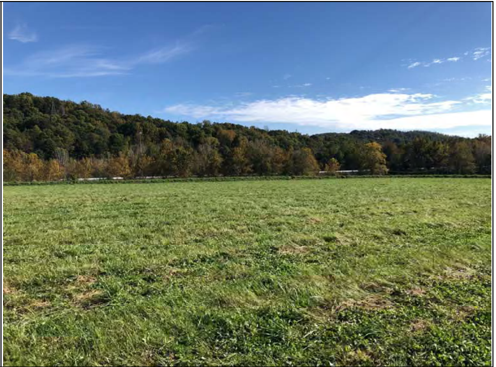
Image: 2505 Date: 10/23/2018 Time: 1:11 PM Direction: Northeast Description: Stage 6 final cover. Vegetation is healthy and well maintained. No evidence of animal burrows, erosion, or stability.

Image: 2503 Date: 10/23/2018 Time: 1:11 PM Direction: East Description: Stage 6 final cover. Vegetation is healthy and well maintained. No evidence of animal burrows, erosion, or stability.