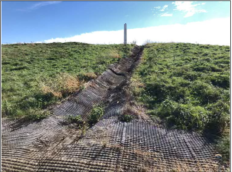
Image: 2569 Date: 10/23/2018 Time: 1:38 PM Direction: East Description: Stormwater swale is in good condition. Well maintained with healthy vegetation. No debris or obstructions.

Image: 2567 Date: 10/23/2018 Time: 1:37 PM Direction: South Description: Non-contact stormwater downchute. Clear of obstructions. Revetment is in good condition. Functioning as intended. Stage 5 final cover is in good condition with no signs of stability. No animal burrows noted. Vegetation is healthy.