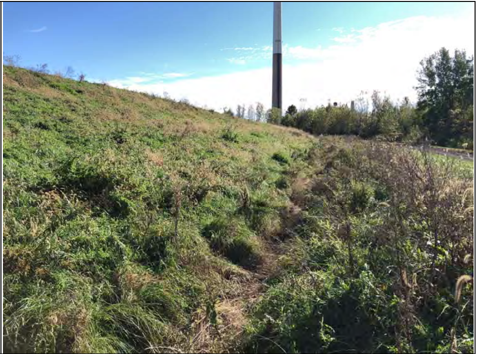
Image: 2543 Date: 10/23/2018 Time: 1:28 PM Direction: Northeast Description: Final Cover on Stage 4 sideslopes is in good condition with no evidence of damage from erosion, animals, or sloughing or stability issues.

Image: 2541 Date: 10/23/2018 Time: 1:28 PM Direction: South Description: Non-contact stormwater ditch along Phase 4 is free of obstructions and does not exhibit scour or erosion issues.