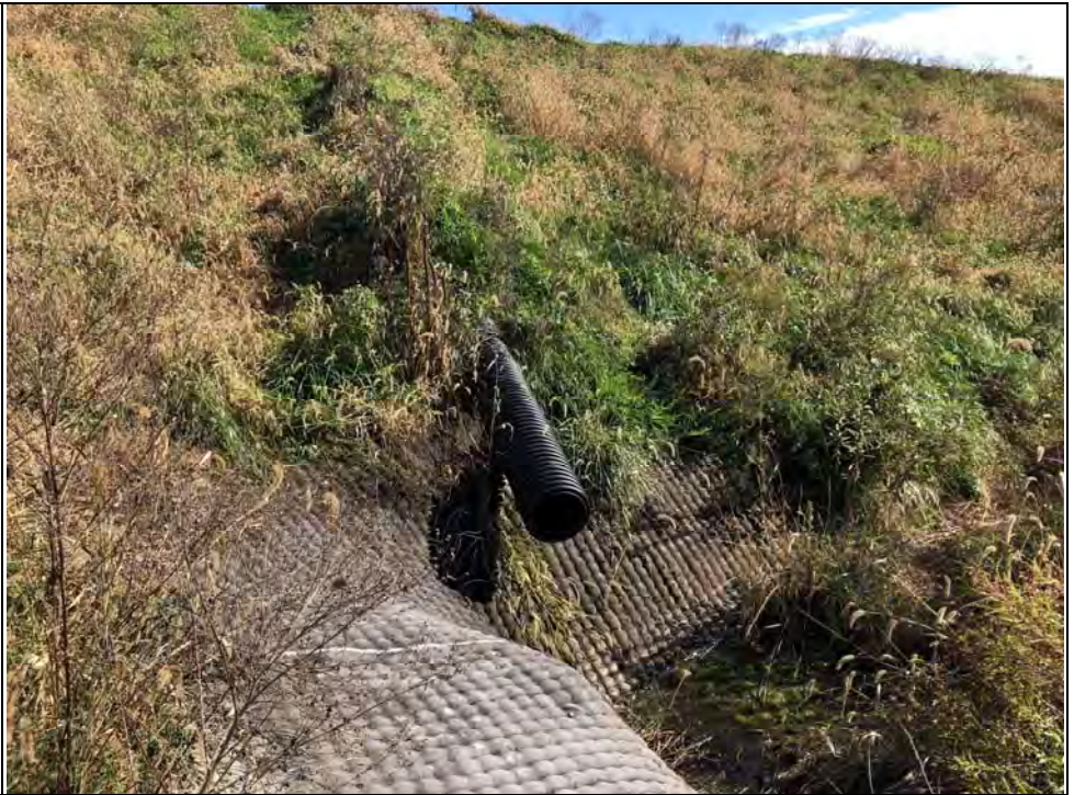
Image: 2551 Date: 10/23/2018 Time: 1:31 PM Direction: Northeast Description: Leachate pipe (on left) discharging into contact water ditch, which ultimately flows to Leachate Pond. Leak detection pipe (on right) which was not flowing, demonstrating that the liner is not leaking. Ditch is clear of obstructions.

Image: 2549 Date: 10/23/2018 Time: 1:30 PM Direction: Southeast Description: Non-contact stormwater discharge pipe from upper bench into non-contact water ditch.