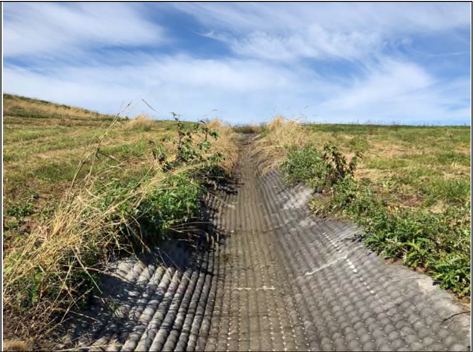
Image: 2493 Date: 10/23/2018 Time: 1:08 PM Direction: South Description: Non-contact stormwater downchute is clear of obstructions. Gabion energy dissipator is installed at the junction with the stormwater (non-contact water) perimeter ditch.

Image: 2491 Date: 10/23/2018 Time: 1:08 PM Direction: North Description: Non-contact stormwater downchute. Clear of obstructions. Revetment is in good condition. Functioning as intended.