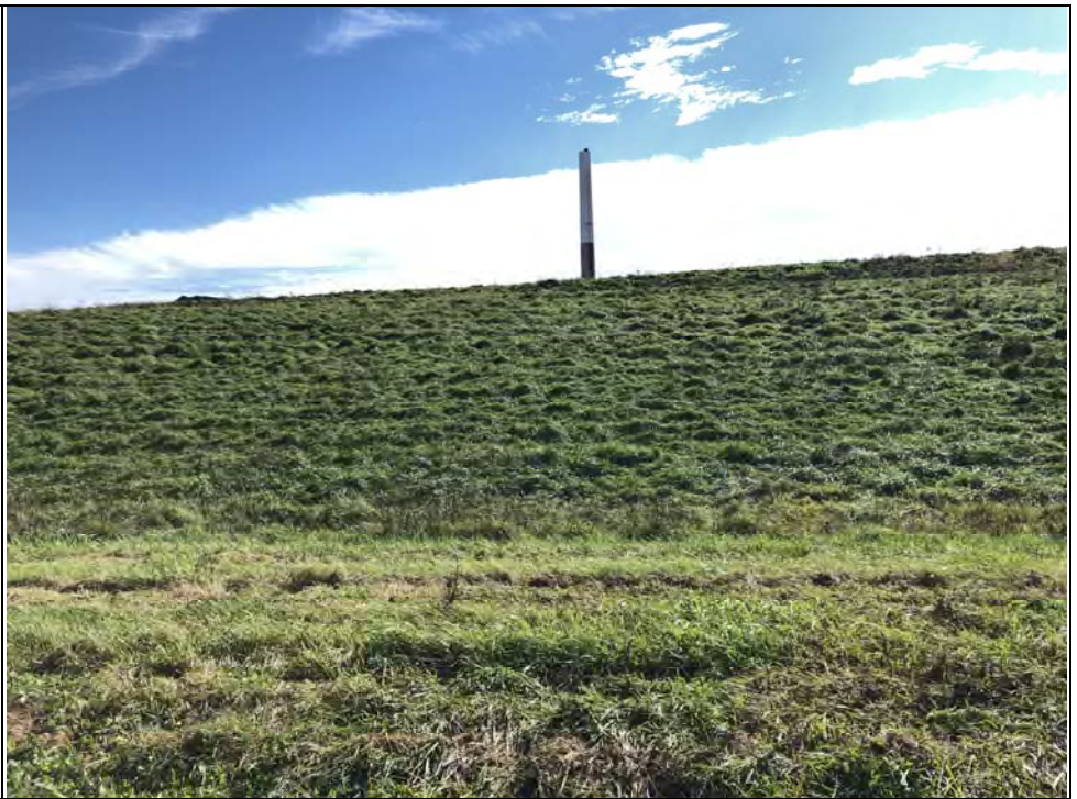
Image: 2573 Date: 10/23/2018 Time: 1:39 PM Direction: Southeast Description: Stormwater swale is in good condition. Well maintained with healthy vegetation. No debris or obstructions.

Image: 2571 Date: 10/23/2018 Time: 1:39 PM Direction: South Description: Stage 5 final cover is in good condition with no signs of stability. No animal burrows noted. Vegetation is healthy.