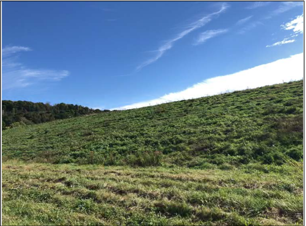
Image: 2577 Date: 10/23/2018 Time: 1:40 PM Direction: South Description: Stage 5 final cover is in good condition with no signs of stability. No animal burrows noted. Vegetation is healthy.

Image: 2575 Date: 10/23/2018 Time: 1:40 PM Direction: Southeast Description: Stage 5 final cover is in good condition with no signs of stability. No animal burrows noted. Vegetation is healthy.