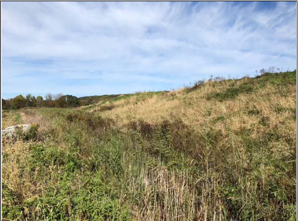
Image: 2559 Date: 10/23/2018 Time: 1:33 PM Direction: Northeast Description: Final Cover on Stage 5 sideslopes is in good condition with no evidence of damage from erosion, animals, or sloughing or stability issues.

Image: 2555 Date: 10/23/2018 Time: 1:32 PM Direction: Northeast Description: Non-contact water ditch exhibits no scour or erosion.