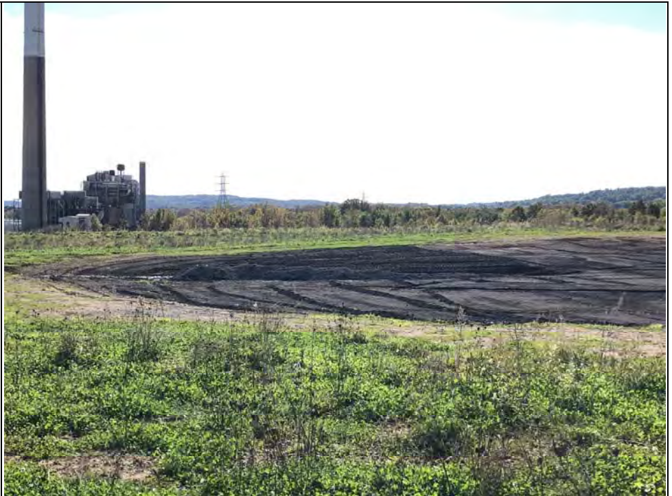
Image: 2517 Date: 10/23/2018 Time: 1:16 PM Direction: Southwest Description: Stage 4 active area. Well graded and compacted. No ponding water.

Image: 2515 Date: 10/23/2018 Time: 1:16 PM Direction: South Description: Stage 4 active area. Well graded and compacted. No ponding water.